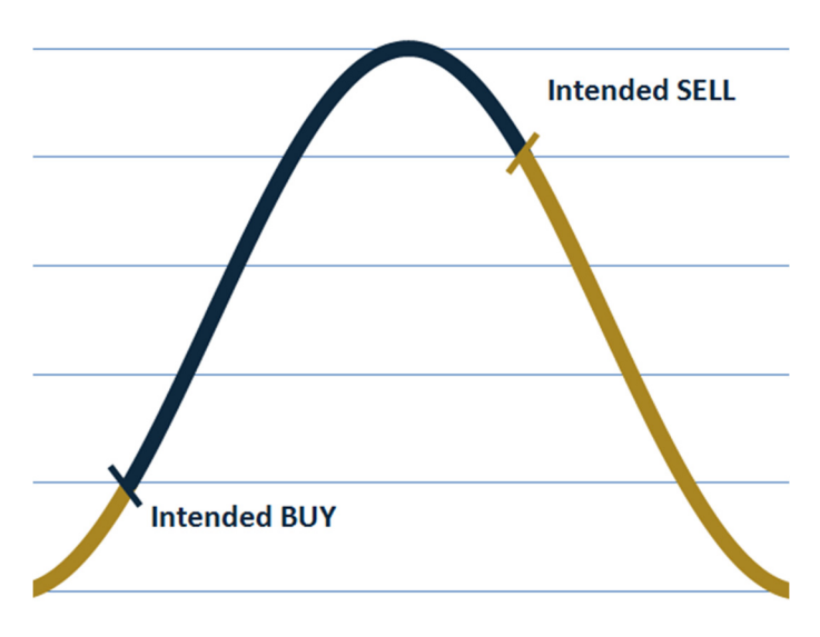
For Illustrative Purposes Only. Not Indicative of Past Performance.